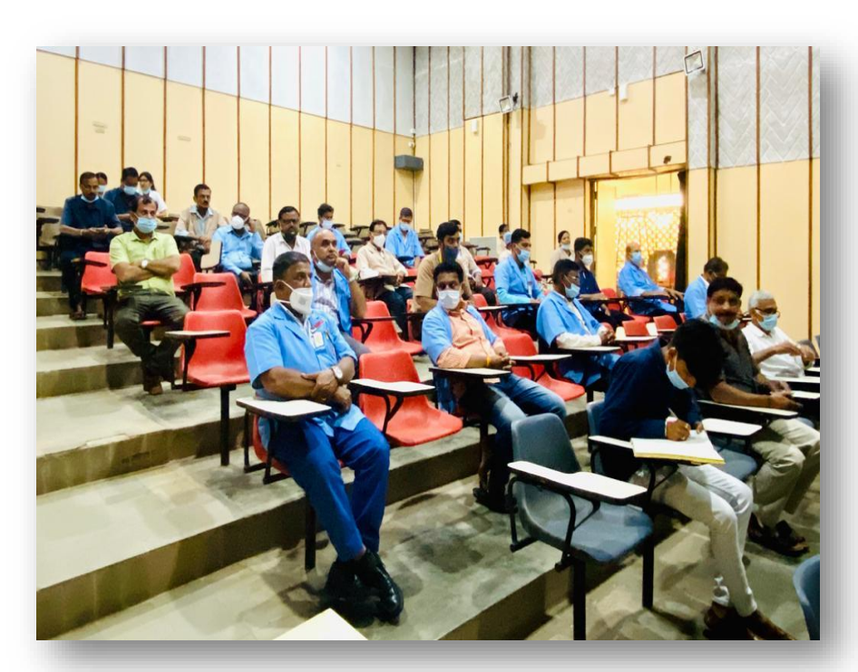
Participants listening to lectures