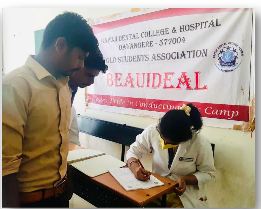
Allotment of referral cards