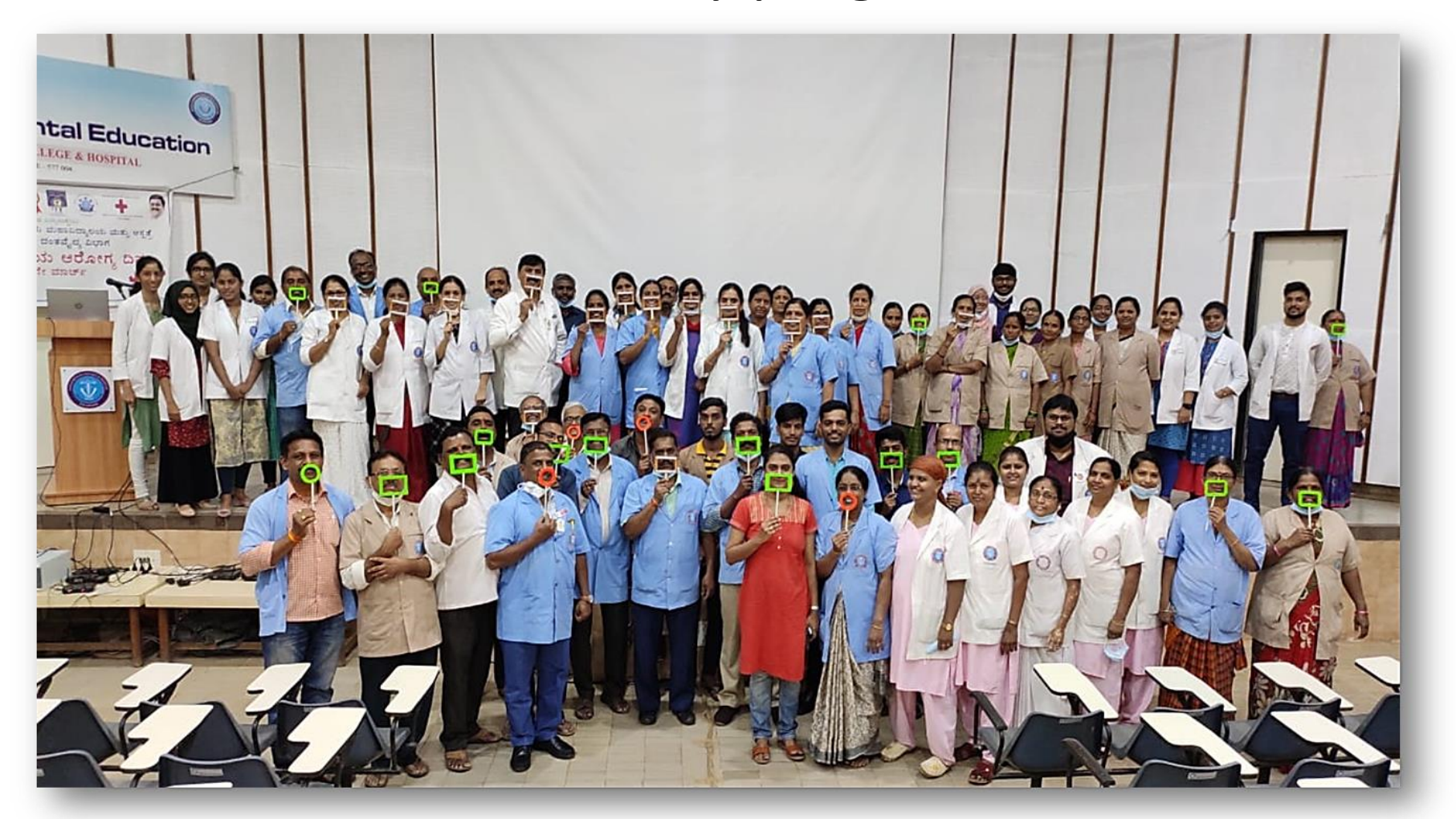
Theme – "We are proud of our mouth"