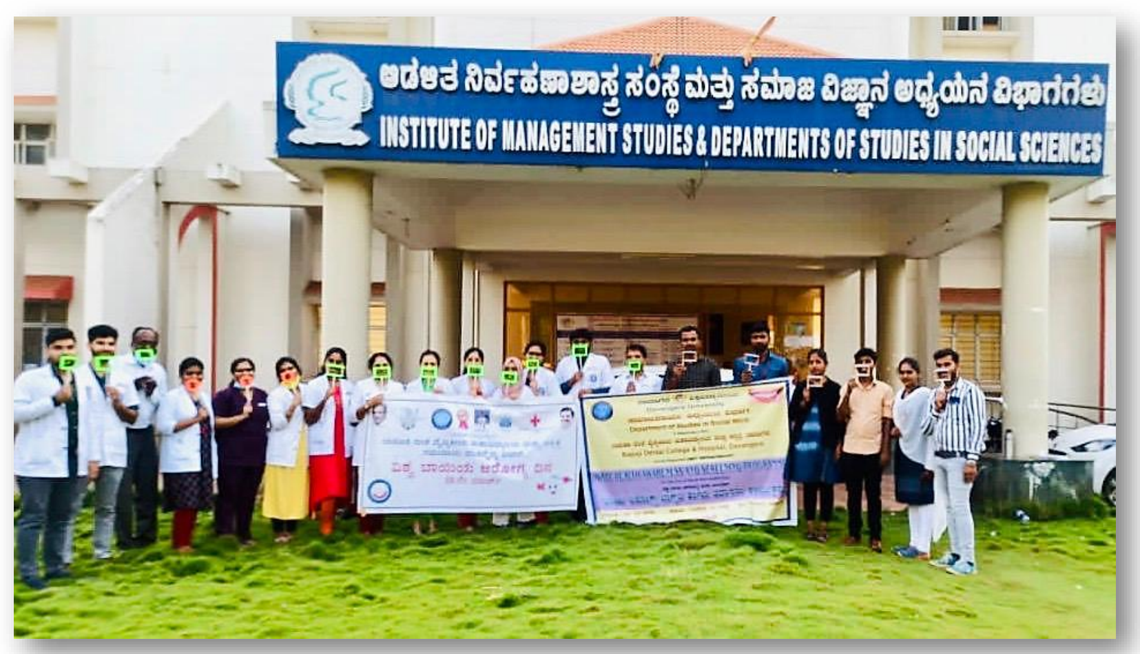
Theme – "We are proud of our mouth"